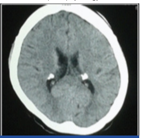
[Table/Fig-1]: Multiple adenoma sebaceum on face [Table/Fig-2]: CT abdomen showing bilateral renal AML with large intratumoural bleed on right side [Table/Fig-3]: CT brain showing calcified Sub ependymal nodules